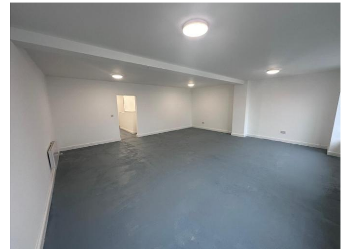
Tenant Fitting Out